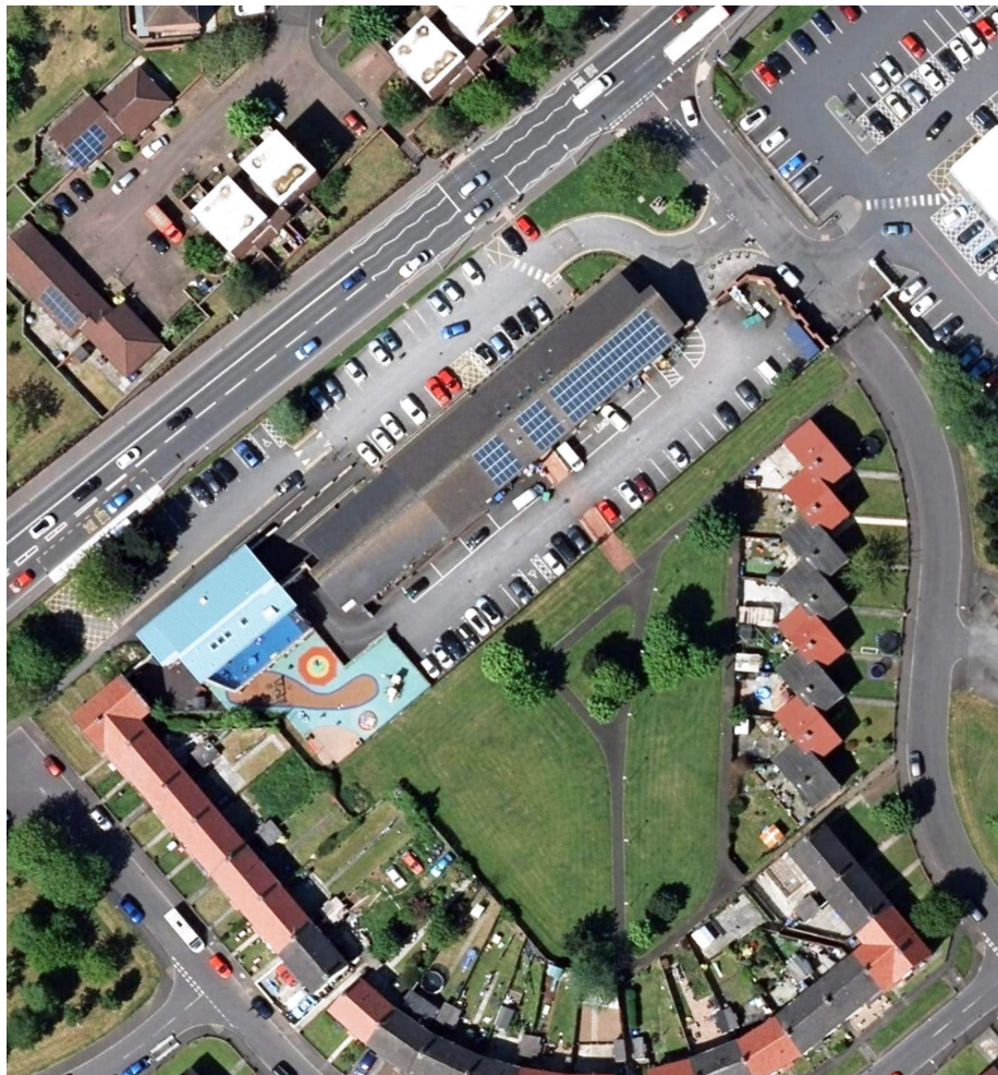
Stewartstown Road Regeneration Project comprises commercial and community buildings, car parks, yards, and grassy parkland – intimately connected with the surrounding Suffolk and Lenadoon communities and the arterial Stewartstown Road

SRRP's estate comprises 22,370 square feet of commercial buildings with associated car parking and landscaping and approximately 2/3 acre of grass parkland. Construction was carried out in two phases completed in 2002 and 2008.